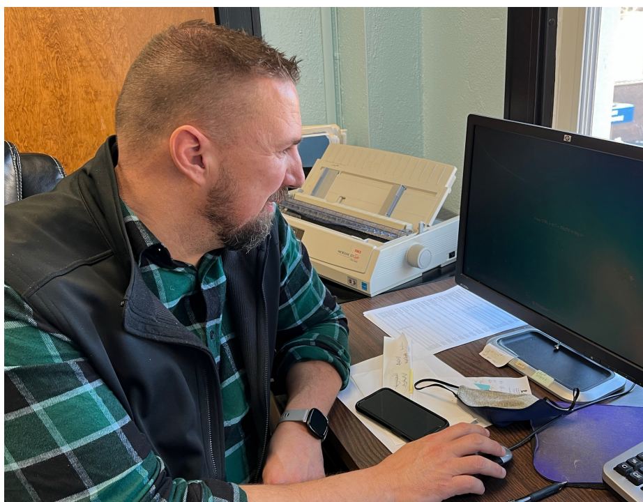
PAGE 6 | SOWKULECH PROMOTED

Announcing the 2022 Human Rights Committee Members. pg. 4