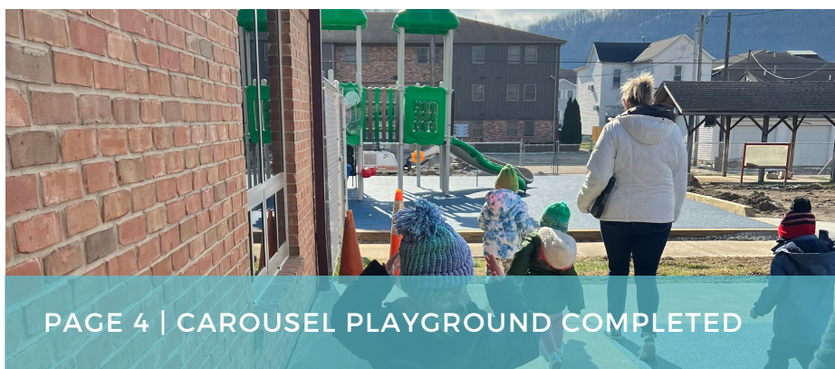
PAGE 4 | CAROUSEL PLAYGROUND COMPLETED